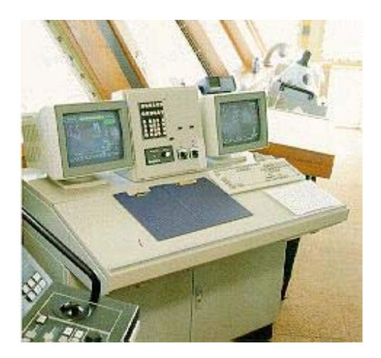
Figure 1: The central unit placed on the bridge of the vessel. The left screen is used for real-time control tasks such as speed settings while the right screen is used for long term voyage analysis and follow-up.