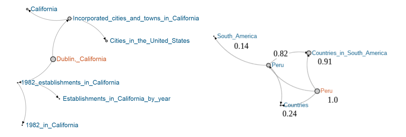
Figure 2: Category graphs of Dublin, California (left) and Peru (right)

than the ones directly assigned by the Wikipedia editors, that can be too restrictive. In Fig. 2, Dublin belongs to Cities in the Republic of Ireland , but not to Ireland . A graph using direct categories only would then link Dublin to places in Ireland, but not to Irish movies, politicians, or museums.